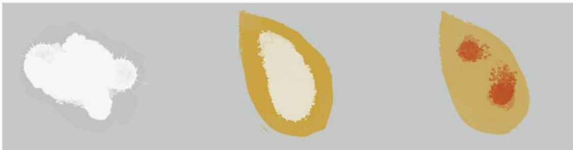
NORMAL CALCIUM DEPOSIT